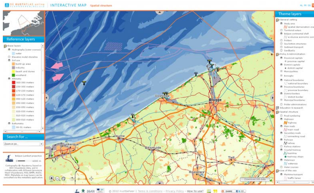
Figure 1: Interactive web GIS within the Belgian Coastal Atlas

The target audience of the Belgian Coastal Atlas is wide and includes coastal stakeholders, scientists, policy and decision makers, educational users, public users and (marine) industry.