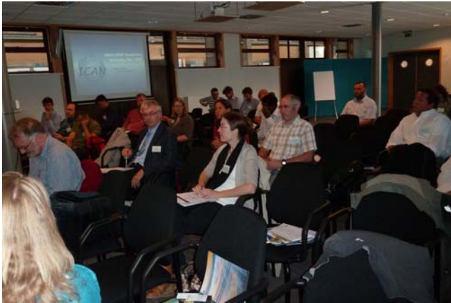
ICAN session about to start

This workshop report has an accompanying web site at http://ican.science.oregonstate.edu/ican5 from which the reader may download all PowerPoint files presented at the workshop, as well as working papers and prior reports, breakout group notes, photographs, and links to related web sites.