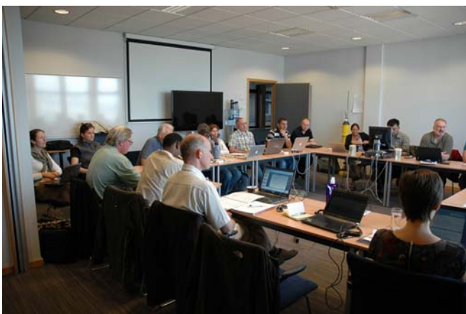
ICAN 5 Final Meeting