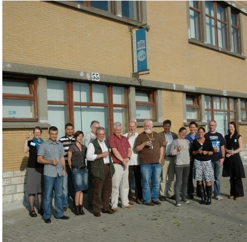
ICAN members celebrating the official launch of the ICAN Handbook

Discussion in this session examined if ICAN objectives were being achieved and if the working groups could improve their support of these objectives. Evidence of ICAN success to date related to the large and representative membership, the publishing of the ICAN Handbook in 2010, the support given by the EU funded NETMAR project to advancing interoperability, the large number of workshops, meetings and events organised by or with participation of ICAN members, and the sharing of software and know-how between members.