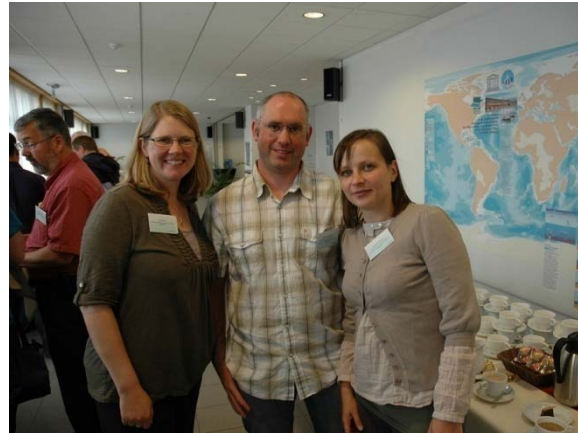
Catching up with old friends