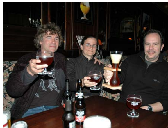
Workshop participants testing the Belgium beer