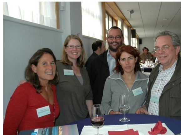
The Belgium Kustatlas launch celebration during ICAN 5