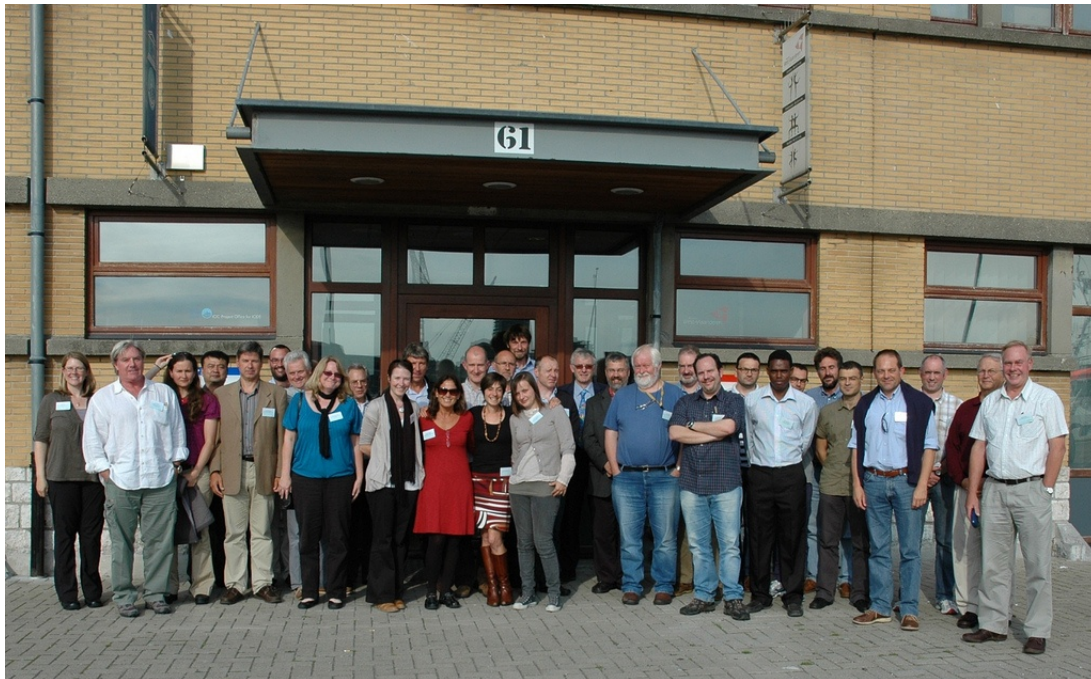
The participants of ICAN 5

The IODE ICAN Pilot Project is a precursor to the establishment of a full IODE ICAN Project which will be proposed to the 22 nd session of the IOC Committee on International Oceanographic Data and Information Exchange (IODE-XXII) in March 2013. In the coming months the existing ICAN working groups will draw up and propose a work programme for the period 2013-2015. The terms of reference for the IODE ICAN Pilot Project are available on the IODE website at: