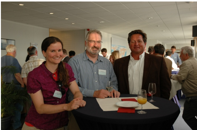
ICAN folk at a well deserved break in between sessions